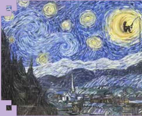
13th January - 6th February Budehaven Community School 'Past & Present'

We are delighted to present an exhibition that brings together the work of both past and present students and staff. This is an opportunity to showcase the talent of the school over its history and so celebrating the creativity present in our local community. We have welcomed submissions from all generations, and are excited to present a body of work that reflects this journey.